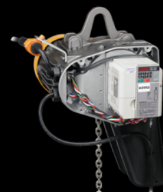
EQ WITH INVERTER