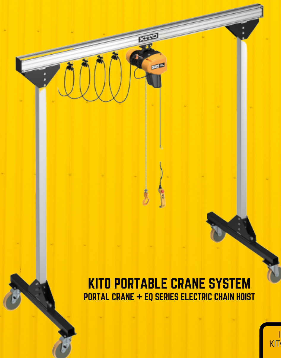
KITO PORTABLE CRANE SYSTEM PORTAL CRANE + EQ SERIES ELECTRIC CHAIN HOIST